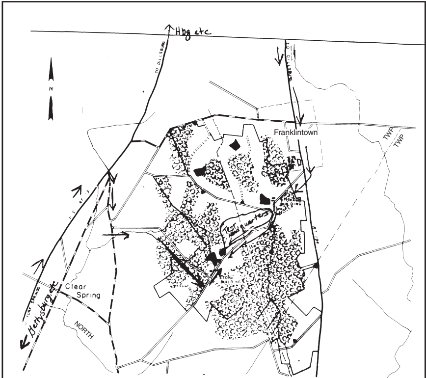
PA GAME LANDS #243 HUNTING TEST HEADQUARTERS